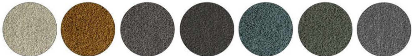
beige 05 bronze 116 brown 15 darkbrown 18 denim 153 forest 162 grey 65