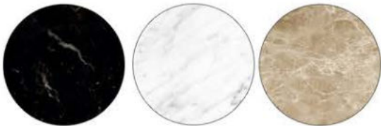
Black White Light brown