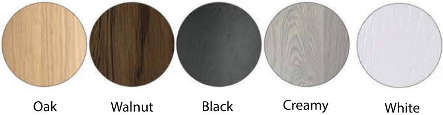
Oak Walnut Black Creamy White