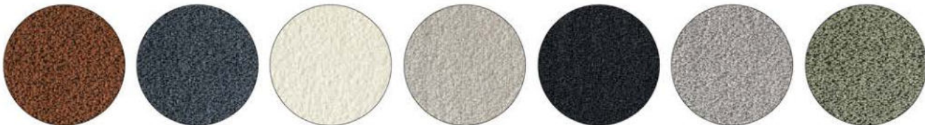
hazel 96 indigo 90 ivory 101 natural 01 onyx 169 steel 149 thyme 206